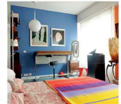
In the neutral-toned dining area (left) Fabrice chose Achille Castiglioni's iconic Taraxacum suspension light to illuminate George Nelson's modernist chairs. Background colours in the bedrooms (above) are bolder.